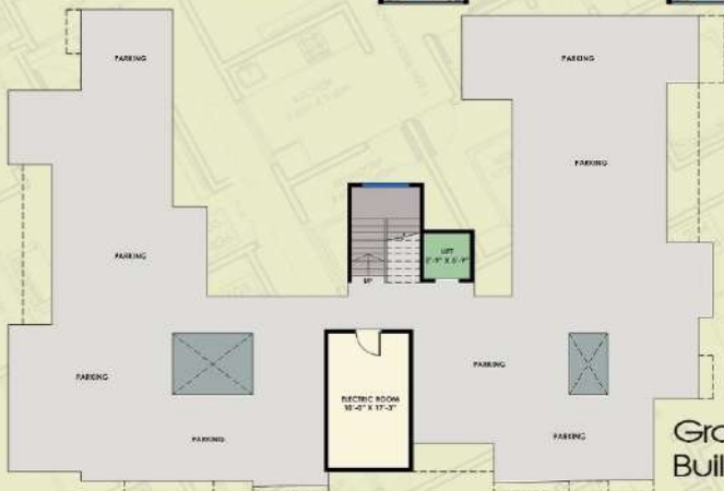
Ground Floor: Building A