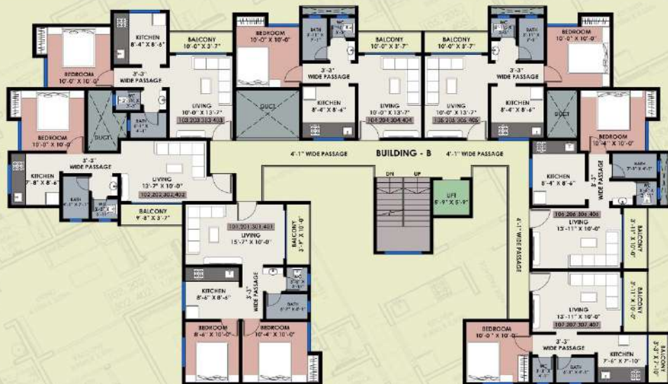
3D Floor Plan: Building B